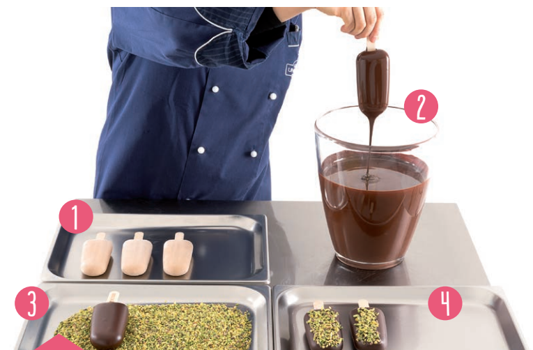
Gelato with crunches