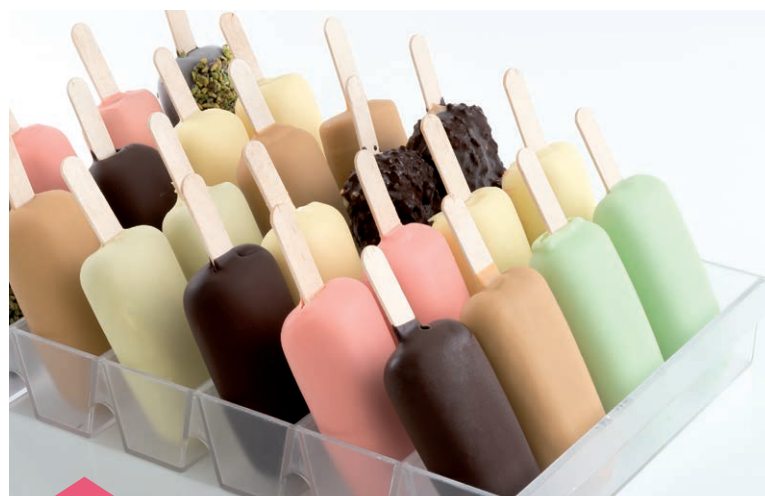
Variety of gelato on a stick