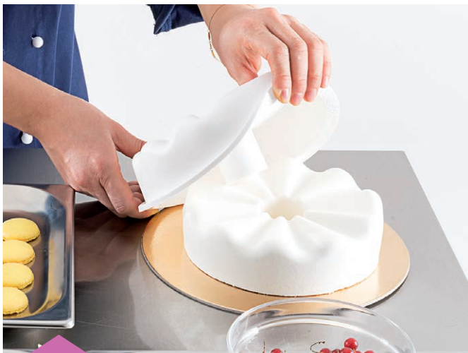
Extracting the cake from the mould