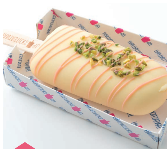
Adding value to stick treats