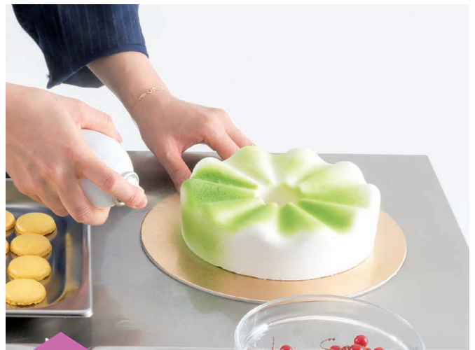
Personalization with food colouring