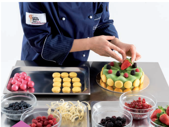
Decoration with fruit and chocolate curls