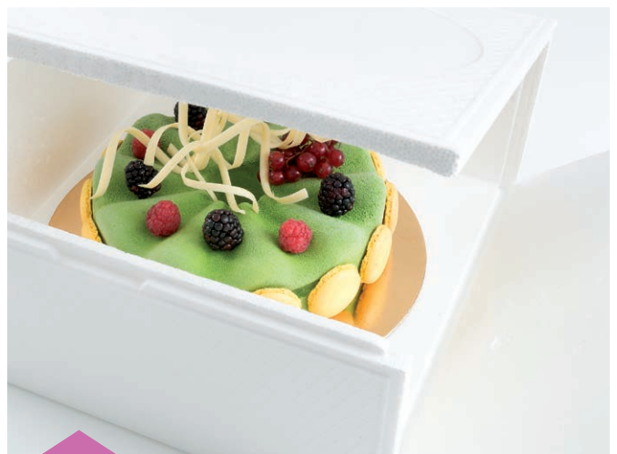
Take-away and home delivery